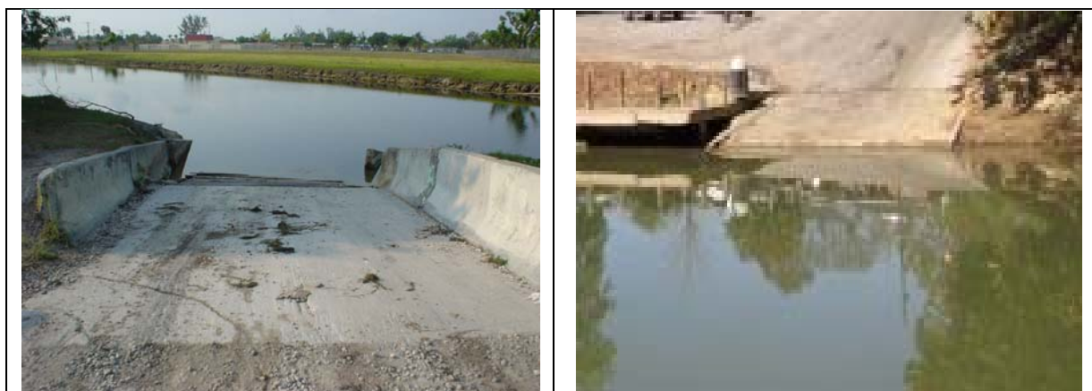
Figure 5: Typical view of ramps

Whenever the wild animals fall into the canal, it is proposed to construct ramps with rough surface of 5 m at every 300 m. This will enable the animals to easy access the ground immediately. About 25 ramps are proposed.