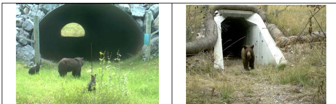
Figure 2: Typical view of culvert

Underpasses (Box culverts) are structures meant for flow of water under the canal. Fifty underpass bridges/culverts of 2 m width will be constructed for every 150 m of Tumkur Branch Canal within WLS as it will help in the movement of vast population of sloth bears along with other small, medium animals and reptiles. There might be a regular wildlife movement near to this chain linkage due to available water source. Construction of the passage in this area help the easy movement of the wildlife without disturb in their regular movement.