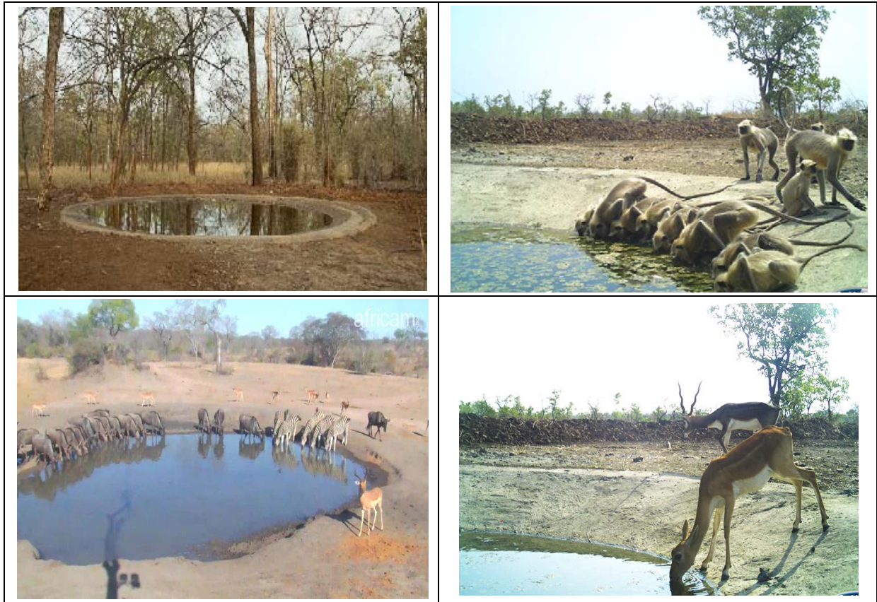
Figure 3: Typical view of water holes