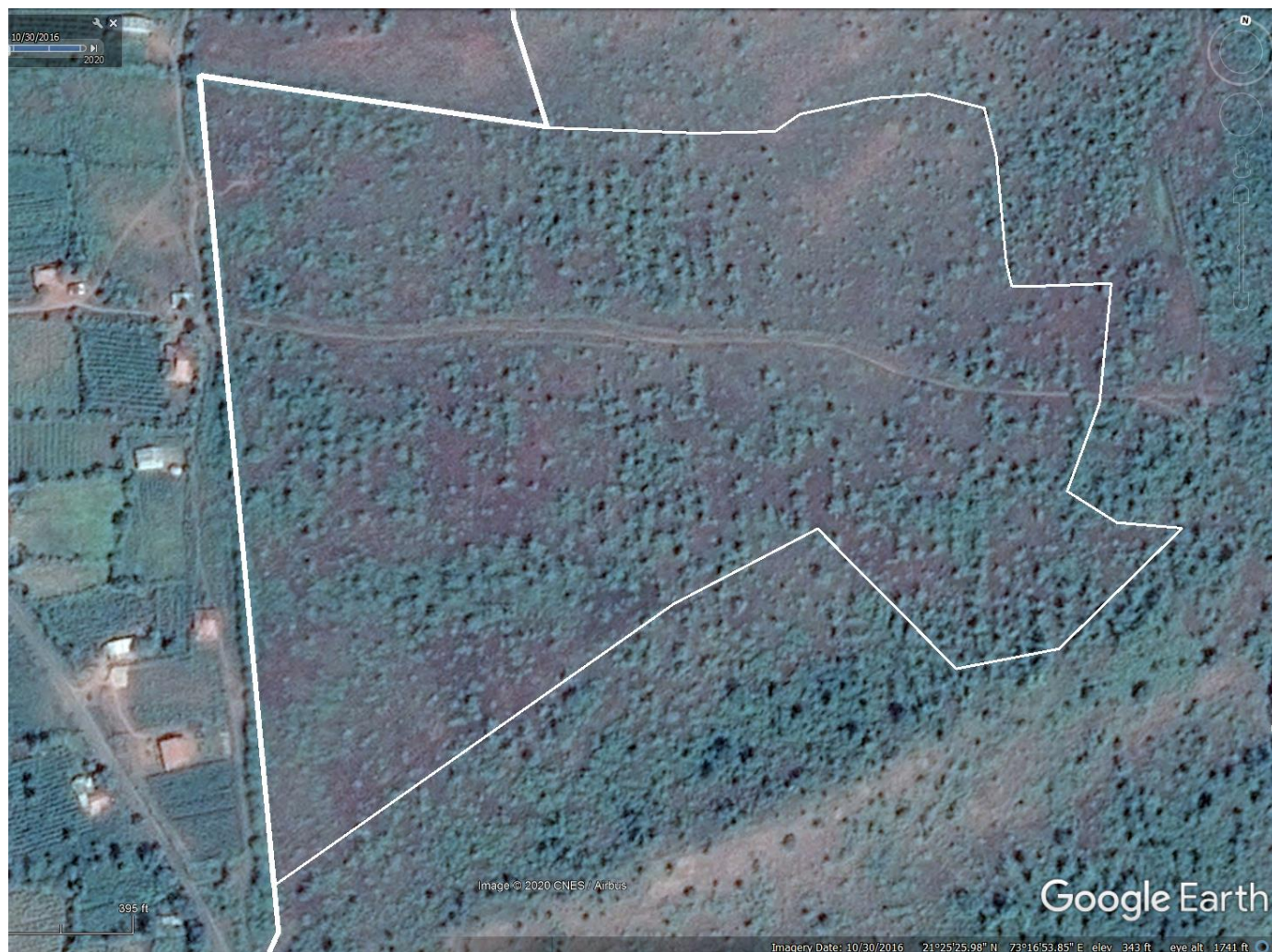
Figure: Google Earth view of Proposed CA Land (8.1 ha (GE-30/04/2016))

(MoEF FSI DECISION SUPPORT SYSTEM GEOPORTAL)