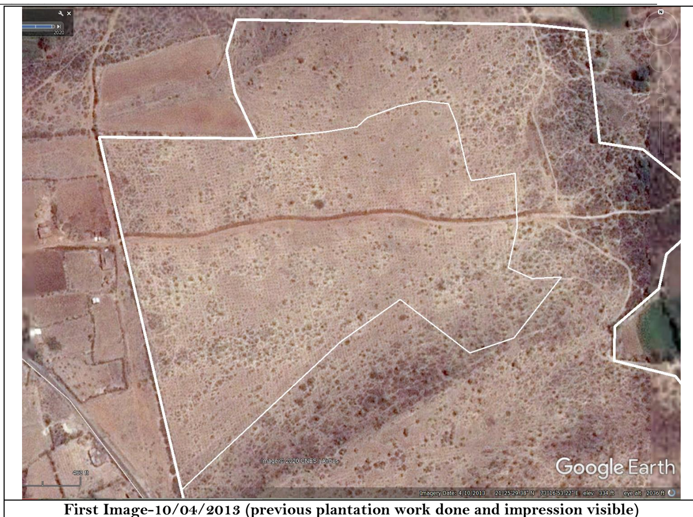
First Image-10/04/2013 (previous plantation work done and impression visible)

(MoEF FSI DECISION SUPPORT SYSTEM GEOPORTAL)