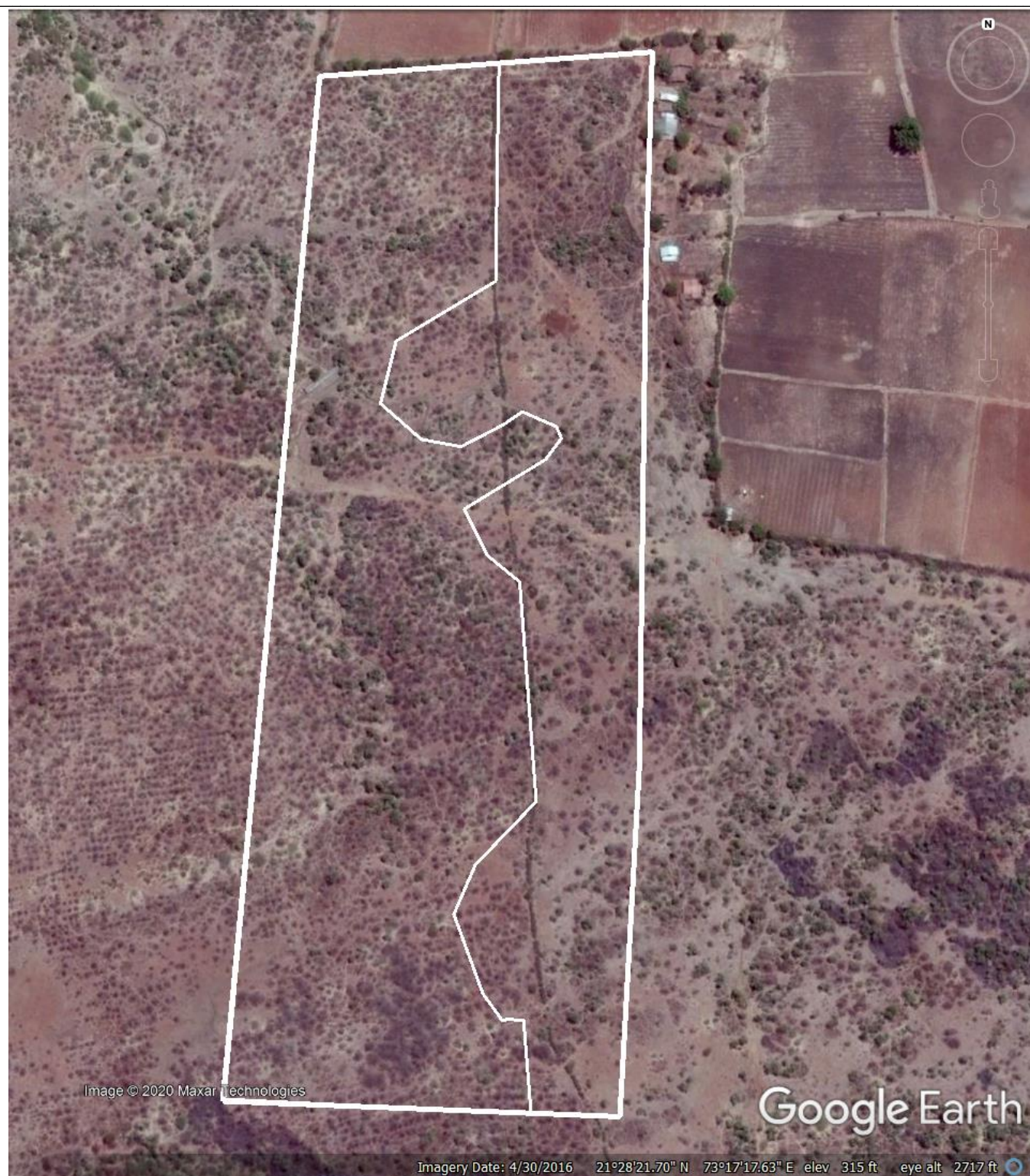
Figure: Google Earth view of Proposed CA Land (previous plantation Impression)

(MoEF FSI DECISION SUPPORT SYSTEM GEOPORTAL)