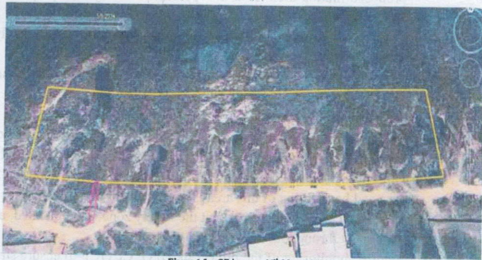
Figure 6.2 – GE imagery 08 th March 2024

The proposed mining area is a broken area as also can be seen from the time series data analysis of google earth imagery 2014 & 2024 as under:-