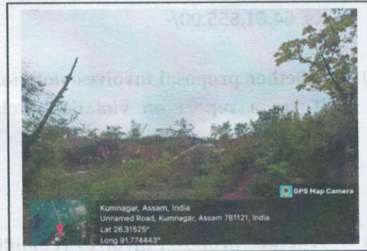
Photographs of the identified CA site in Dakhun Mandakata Village in North Kamrup

Whether land for compensatory afforestation is suitable from plantation and management point of view or not.