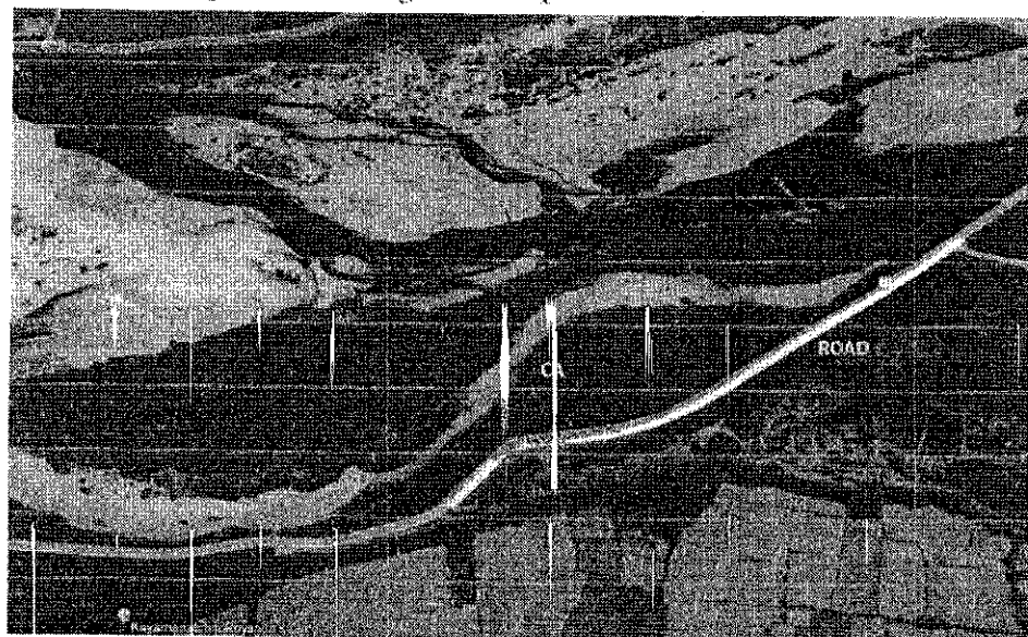
During flooding period August 2022