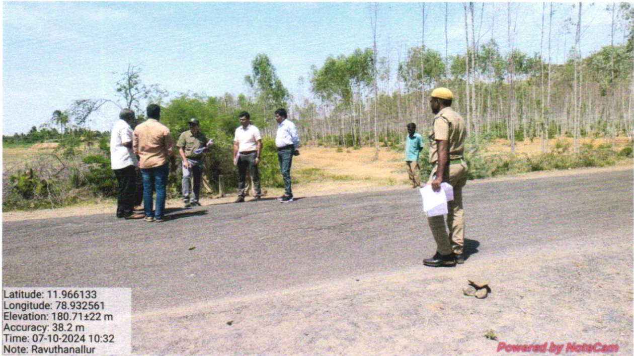
Annexure -3. Photographs taken during Inspection of diversion of 0.768 ha of forest land of Ravathanallur RFs of Villupuram FD for road expansion work on Vellimalai Moolakadu road between Pakkam and Ravathanallur villages Sankarapuram, Kallakuruchi District.