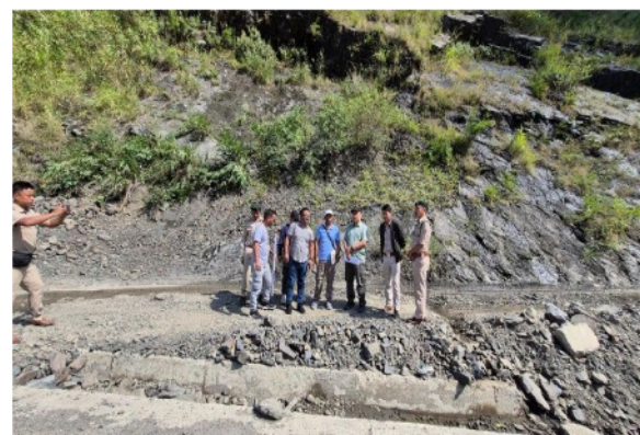
Photographs taken during the site inspection of quarrying of sandstone/ road metal of M/S Shyamchand & Sons Stone Crushing Centre at Longa Koireng, Kangpokpi District, Manipur.