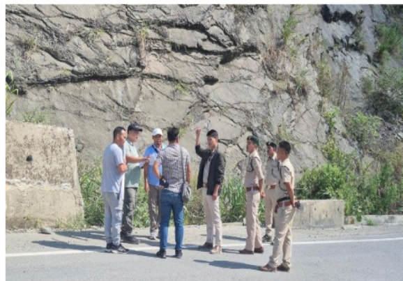
Photographs taken during the site inspection of quarrying of sandstone/ road metal of M/S Shyamchand & Sons Stone Crushing Centre at Longa Koireng, Kangpokpi District, Manipur.