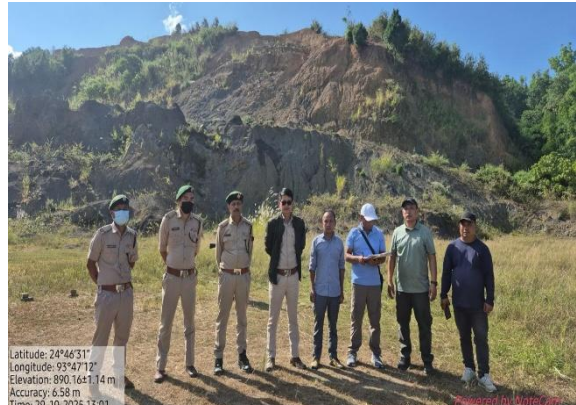
Photographs taken during the site inspection of quarrying of sandstone/ road metal Murum Shaly/Slaty Earth of M/S Noren Enterprises at Lhongchin Village, Kangpokpi District, Manipur by of M/S Noren Enterprises, Brahmapur Nahabam, Imphal.