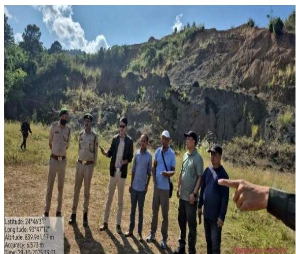
Photographs taken during the site inspection of quarrying of sandstone/ road metal Murum Shaly/Slaty Earth of M/S Noren Enterprises at Lhongchin Village, Kangpokpi District, Manipur by of M/S Noren Enterprises, Brahmapur Nahabam, Imphal.