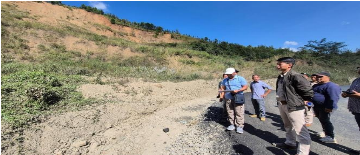
Photographs taken during the site inspection of quarrying of sandstone/ road metal Murum Shaly/Slaty Earth of M/S Sanjit Stone Mining & Crusher at Longa Koireng, Kangpokpi District under Bishnupur Forest Division, Manipur.