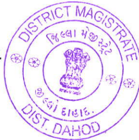
Collector & District Magistrate Dahod