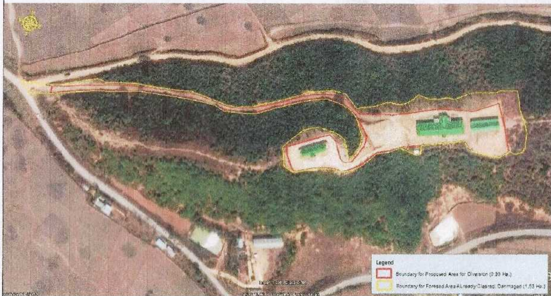
MAP SHOWING THE PROPOSED AREA (0.99Ha.) FOR CONSTRUCTION OF RESIDENTIAL SCHOOL UNDER SSA AND FOREST AREA CLEARED/DAMAGED AT CHINGKHEI CHING RF, CENTRAL FOREST DIVISION