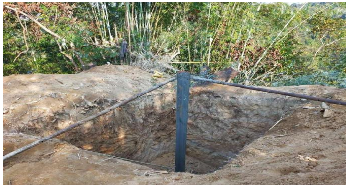
Figure 2.1: Photograph setting template being prepared for final concreting

Foundation size- The average foundation size for each tower leg used on the 400kV transmission system is 5.3m x 5.3m x 3.5m for single circuit tower, 5.1m x 5.1m x 3.5m for double circuit angle.