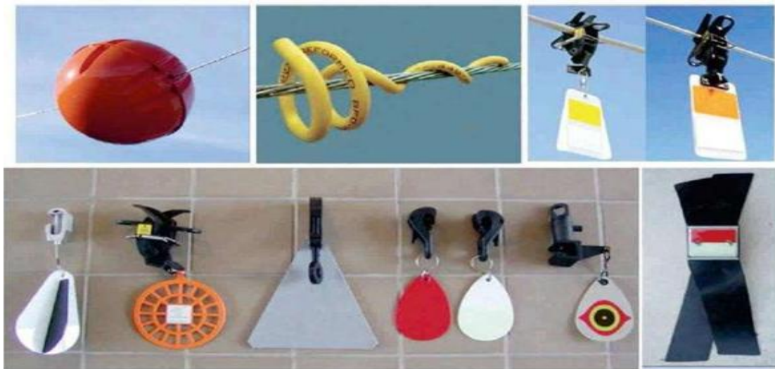
Fig 3.2: Bird Diverter/Coloured/Contrast Marker Devices