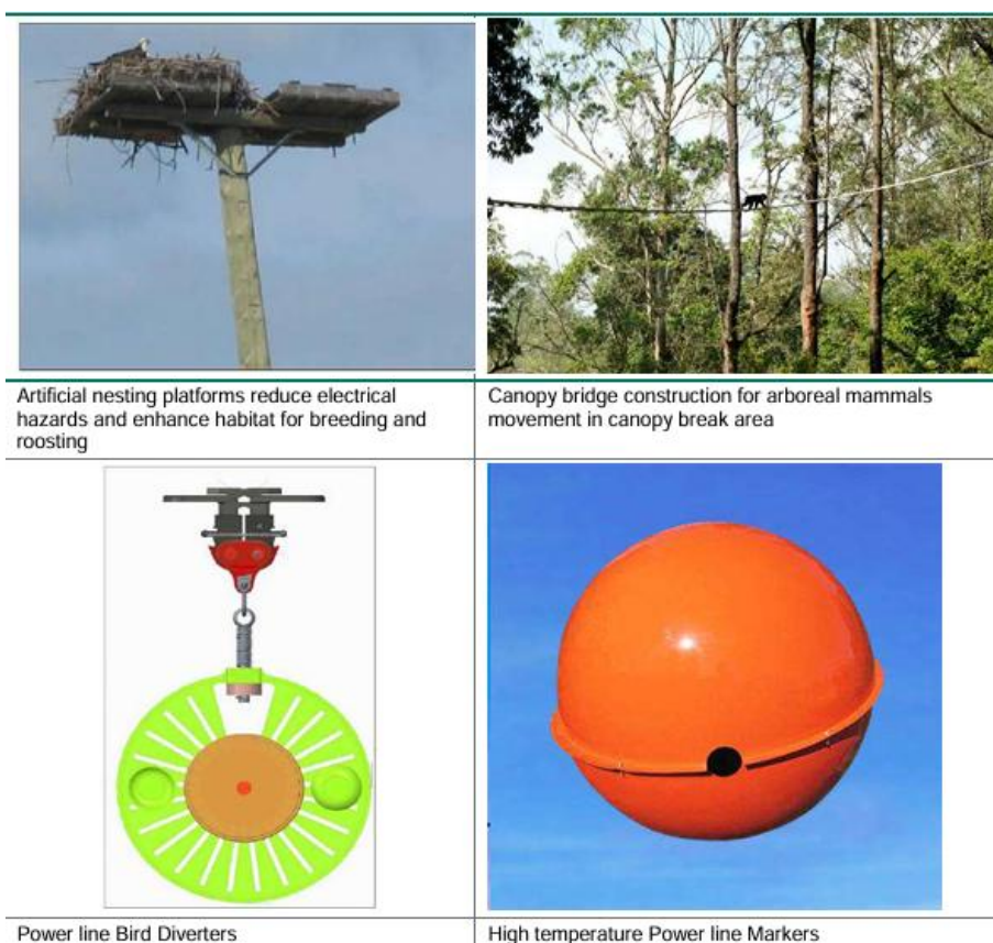
Fig 3.1: Mitigation Structures for Transmission Line