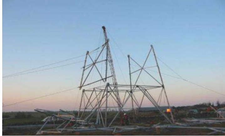
Fig 2.2: Model visual: Derrick pole at the tower base