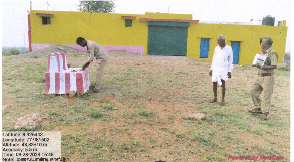
Latitude: 8.926443 Longitude: 77.981502 Altitude: 43.83±10 m Accuracy: 5.5 m Time: 08-28-2024 16:46 Note: மலைபாளையம் சாஸ்திரம்.