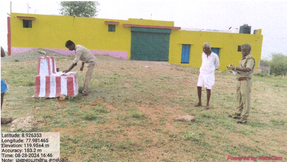
Latitude: 8.926353 Longitude: 77.981465 Elevation: 119.95±4 m Accuracy: 183.2 m Time: 08-28-2024 16:46 Note: மலைபாளையம் சாஸ்திரம்.