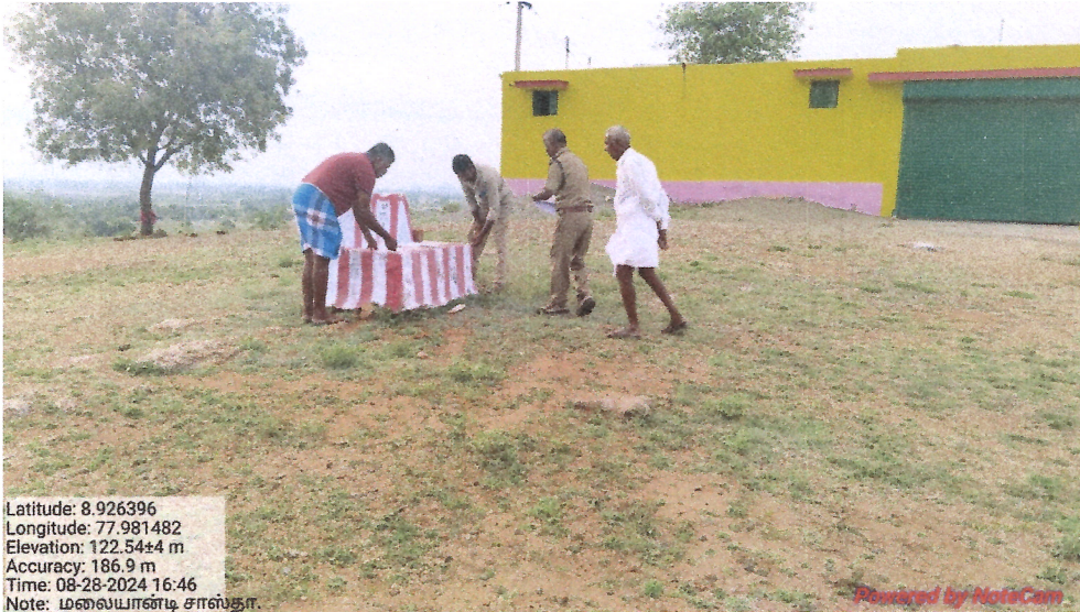
Latitude: 8.926396 Longitude: 77.981482 Elevation: 122.54±4 m Accuracy: 186.9 m Time: 08-28-2024 16:46 Note: மலைபாளையம் சாஸ்திரம்.