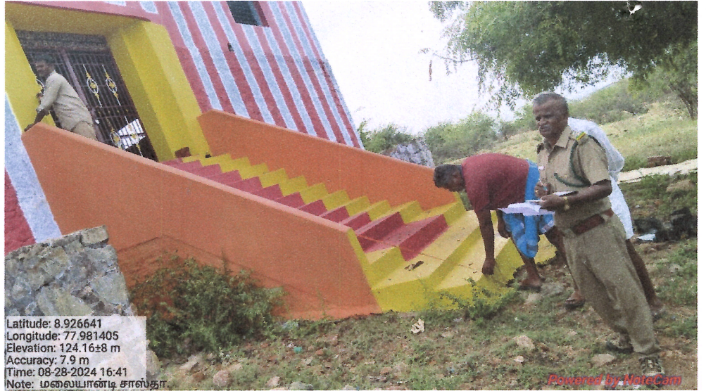
Latitude: 8.926641 Longitude: 77.981405 Elevation: 124.16±8 m Accuracy: 7.9 m Time: 08-28-2024 16:41 Note: மலைபாளையம் சாஸ்திரம்.