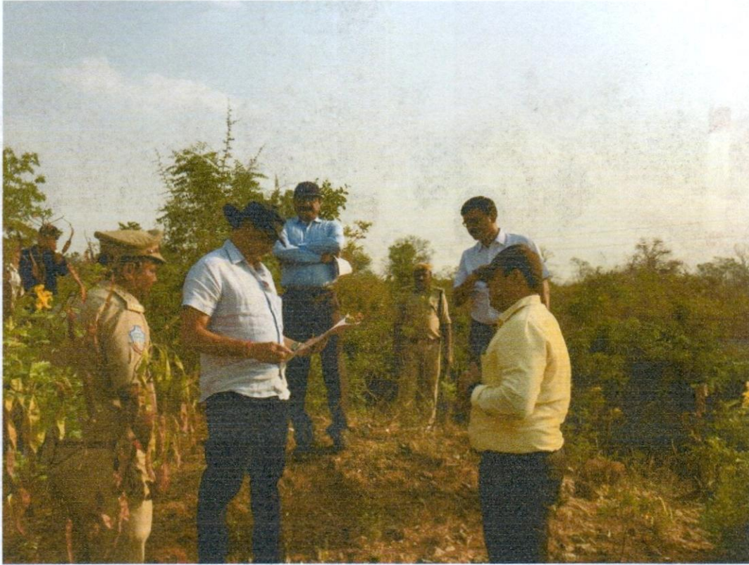
Inspection on 24-03-2019 at Rly.Km.181/18 between MAKUDI - SIRPUR TOWN Railway stations with GPS Point: B-38 in Garlapet Extension-1