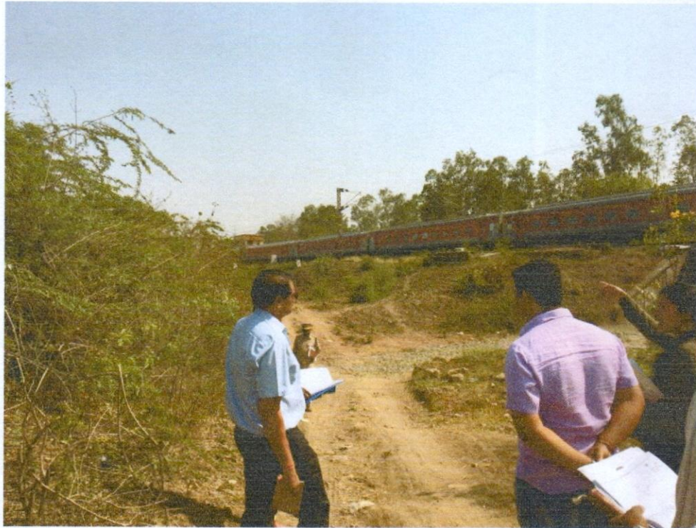
Inspection on 25-03-2019 at Rly.Km.224/13 between ASIFABAD ROAD - REPALLIWADA Railway stations with GPS Point: A-1 in Tandur (Under Bellampally).