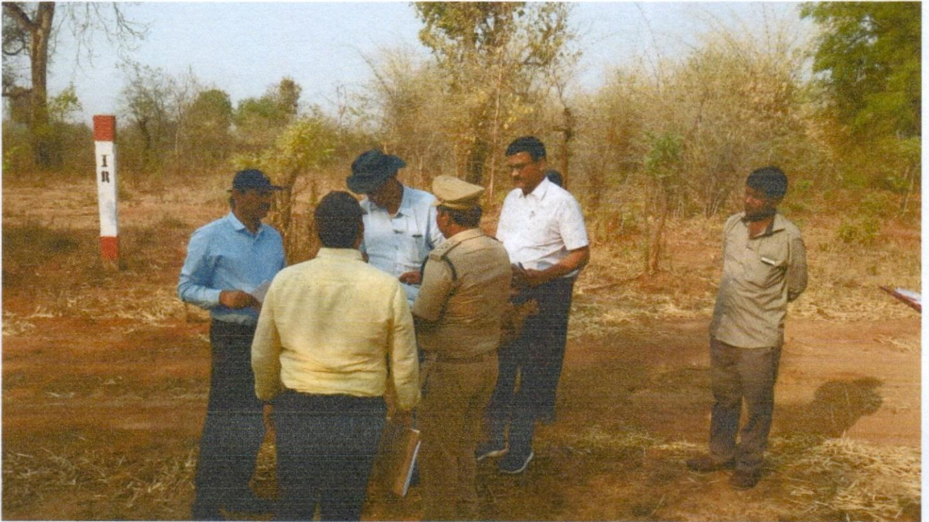
Inspection on 24-03-2019 at Rly.Km.181/18 between MAKUDI - SIRPUR TOWN Railway stations with GPS Point: B-38 in Garlapet Extension-1