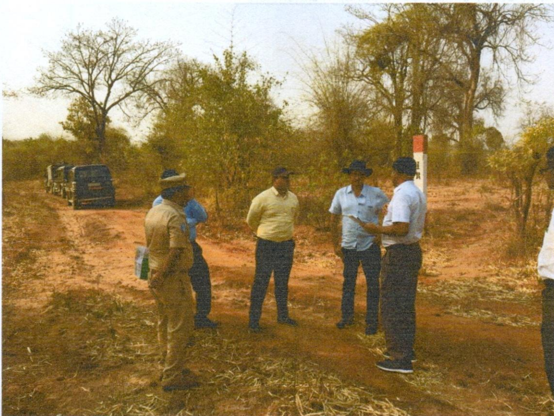
Inspection on 24-03-2019 at Rly.Km.181/18 between MAKUDI - SIRPUR TOWN Railway stations with GPS Point: B-38 in Garlapet Extension-1