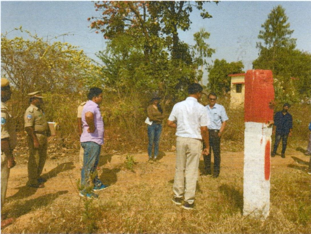
Inspection on 25-03-2019 at Rly.Km.222/7 between ASIFABAD ROAD - REPALLIWADA Railway stations with GPS Point: A-22 in Tandur (Under Asifabad).