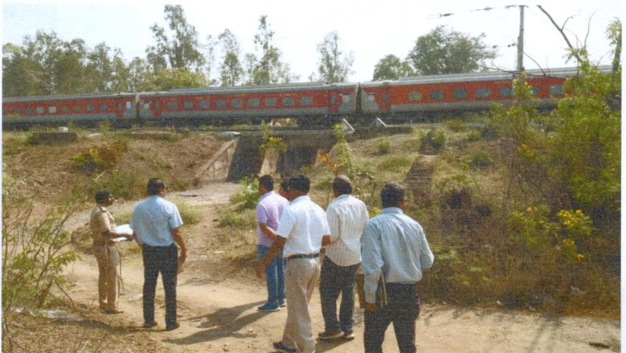
Inspection on 25-03-2019 at Rly.Km.224/13 between ASIFABAD ROAD - REPALLIWADA Railway stations with GPS Point: A-1 in Tandur (Under Bellampally).