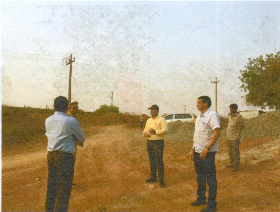
Inspection on 24-03-2019 at Rly.Km.187/27 between SIRPUR TOWN - VEMPALLI Railway stations with GPS Point: B-27 in Achelly .