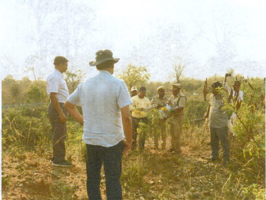
Inspection on 24-03-2019 at Rly.Km.181/18 between MAKUDI - SIRPUR TOWN Railway stations with GPS Point: B-38 in Garlapet Extension-1