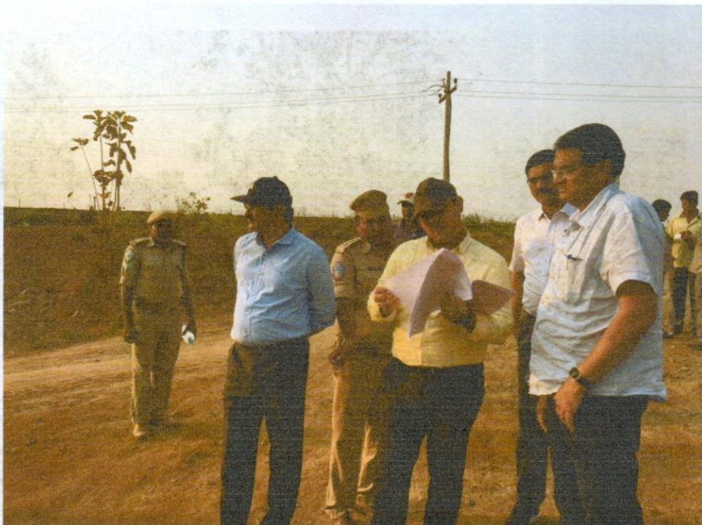
Inspection on 24-03-2019 at Rly.Km.187/27 between SIRPUR TOWN - VEMPALLI Railway stations with GPS Point: B-27 in Achelly .