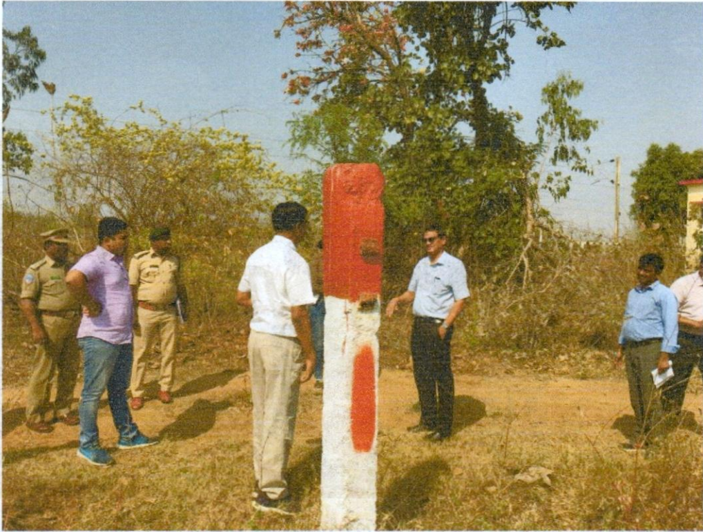
Inspection on 25-03-2019 at Rly.Km.222/7 between ASIFABAD ROAD - REPALLIWADA Railway stations with GPS Point: A-22 in Tandur (Under Asifabad).