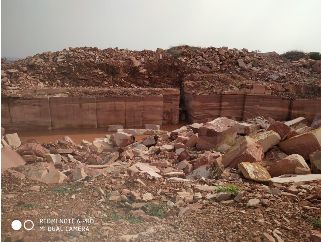
Plate 1: Mining pits developed due to excessive mining