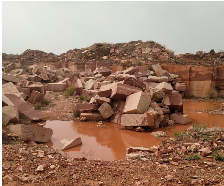
Plate 2 : Material dumped in forest land