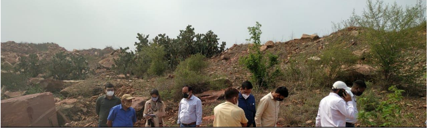
Plate 3: Site Inspection by officials