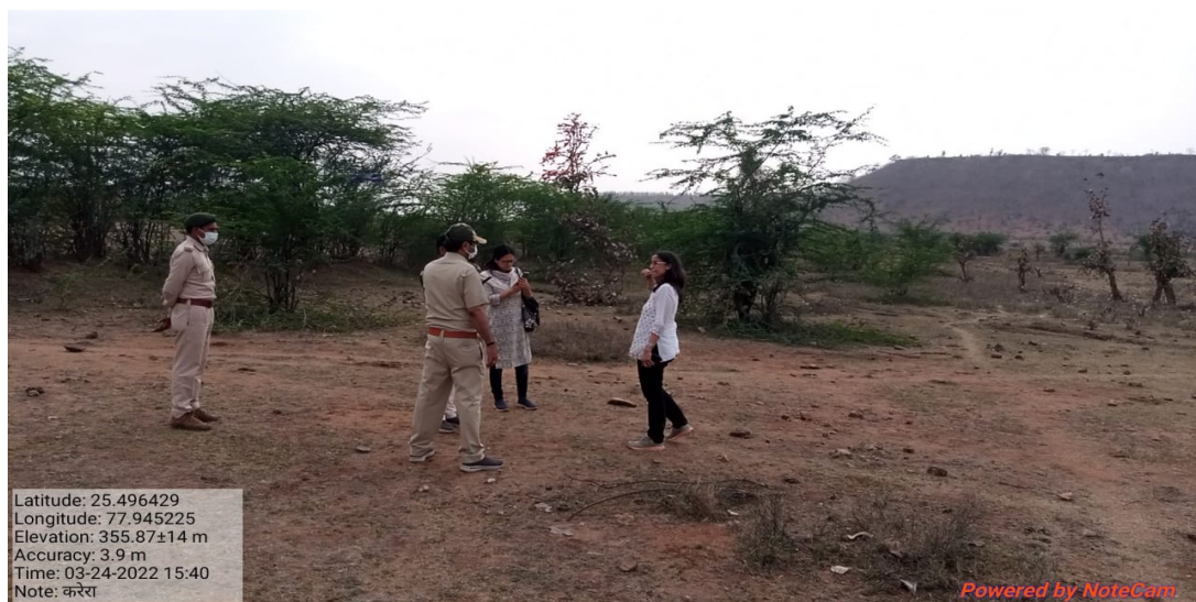
Plate – 4 : Degraded forest land of 27 ha. in Karera proposed for CA