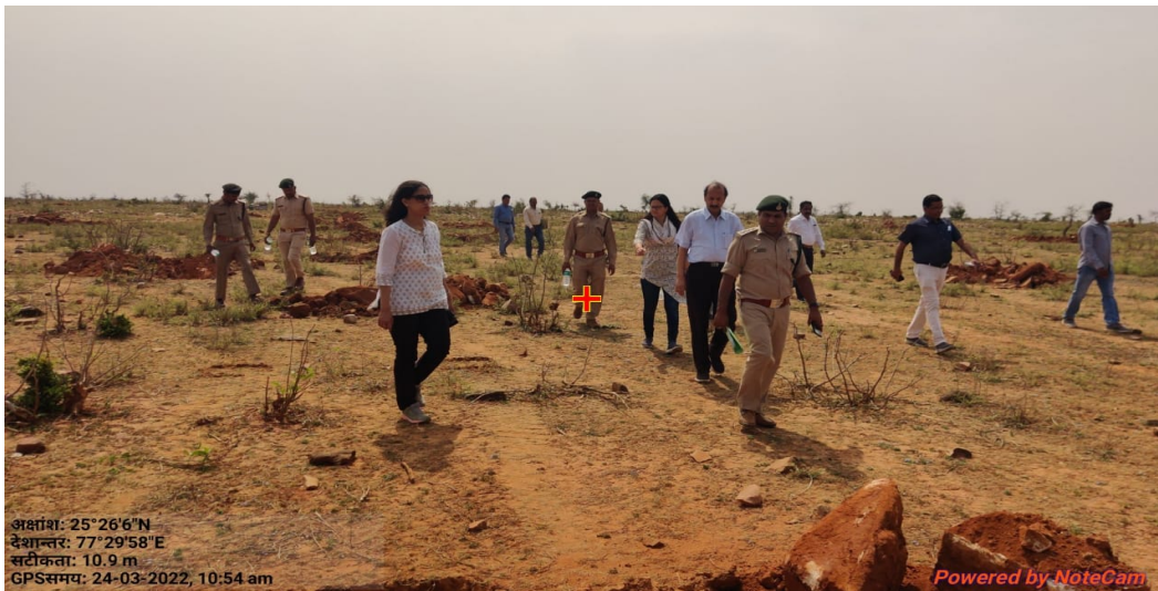
Plate – 2 : Non forest land of 126.42 ha. proposed for CA