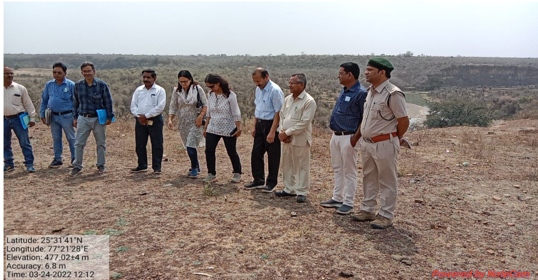
Plate – 3 : Dam Site