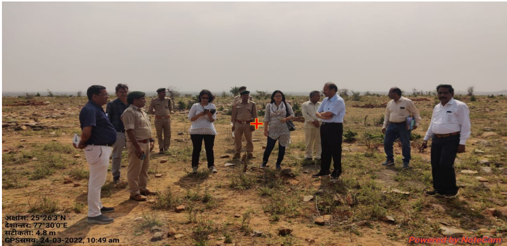
Plate – 1 : Non forest land of 126.42 ha. proposed for CA