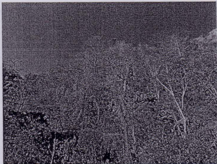
Top: A pillar said to be the boundary of the CA plantation. Middle: View of the area which is said to be the plantation area