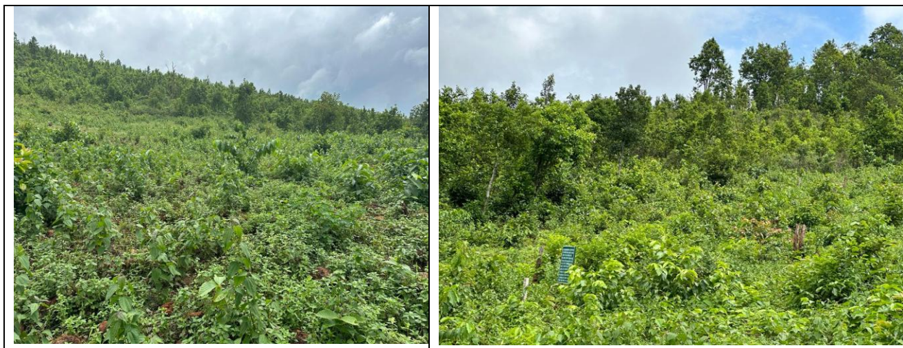
Photographs of proposed CA Site

During inspection the DFO, Keonjhar said that out of 156.978 ha of non-forest land, ANR plantation over 50.00 Ha @ 500 seedlings/ha and over 5.00 ha @ 1600 seedlings/ha have been proposed. Thus total 33,000 seedlings will be planted over 156.978 ha of non-forest land. In order accommodate balance 1,23,978 seedlings (1,56,978 – 33,000) , the DFO, Keonjhar has identified 189.722 Ha of degraded forest land in Jadipada RF under Keonjhar Forest Division. The DFO, Keonjhar has proposed AR Plantation @ 1000 seedlings/ha over 92.946 Ha, ANR plantation @ 500 seedlings/ha over 74.237 ha and ANR Plantation @ 200 seedlings/ha over 8.00 ha of degraded forest land.