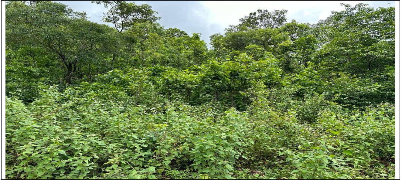
Photographs of proposed site for diversion.

Within the proposed area there is road entering inside the lease area. There are also other narrow earthen roads within the proposed area. During inspection, it is noticed that some patches of proposed forest land is under Podu cultivation and some patches are degraded grass land.