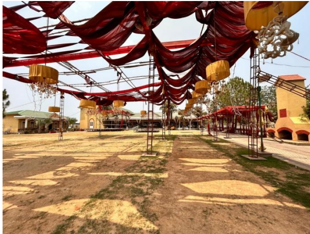
Common hall constructed