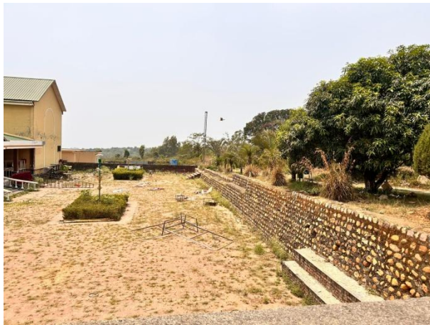
Area proposed for room construction