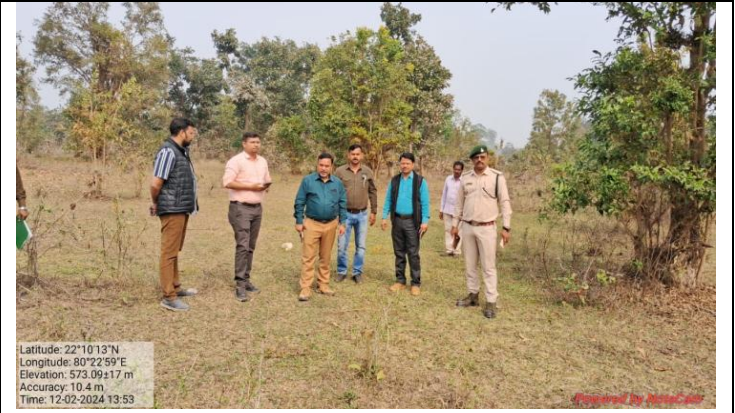
Proposed Area for CA