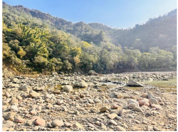
The project site