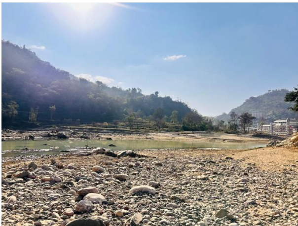
The current water flow in Son Khad