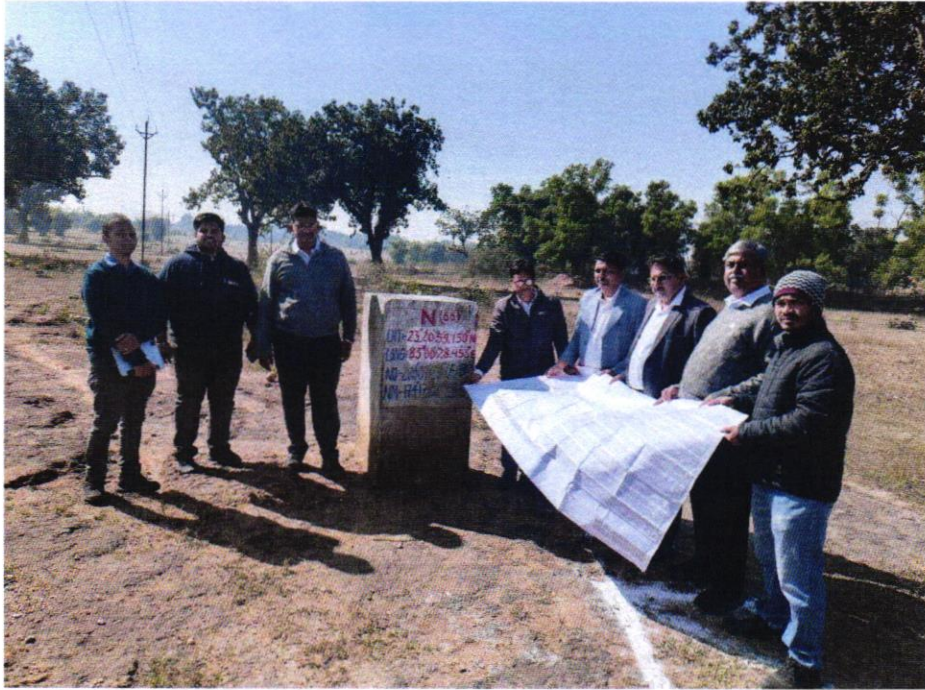
Pillar No. 66 at Comp. No. 1692