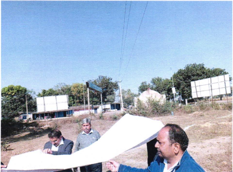
Encroachments on the surface are seen in the background