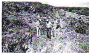
While the term 'invasive' is open to interpretations, a few Board members, who attended the meeting, assumed that it would be an aerial exploration for the mineral.

Minutes of the first-ever meeting by the Board in De-