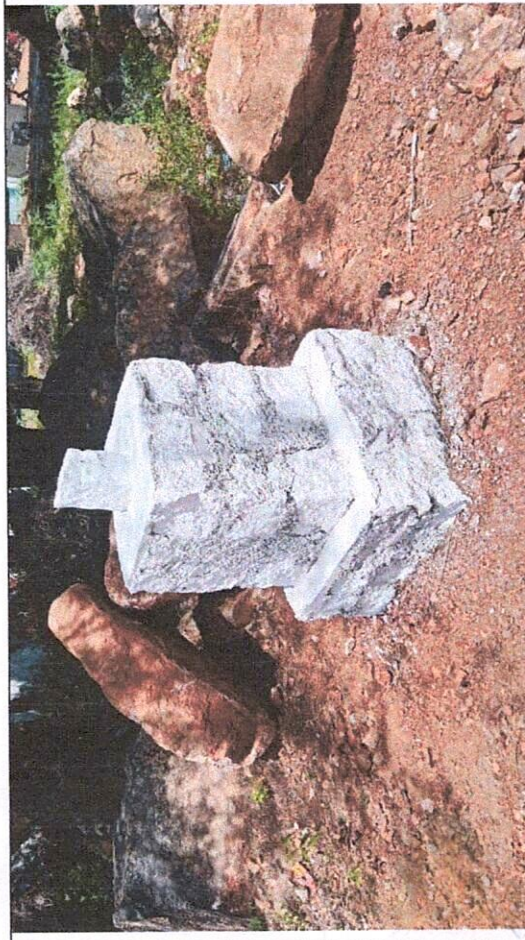
Eriyur north RF (Eriyur Ganeshapuram to Kalungupatti village) admitted Right of Way - 1792.6 m , 11 cairn stones where build by TWAD BOARD