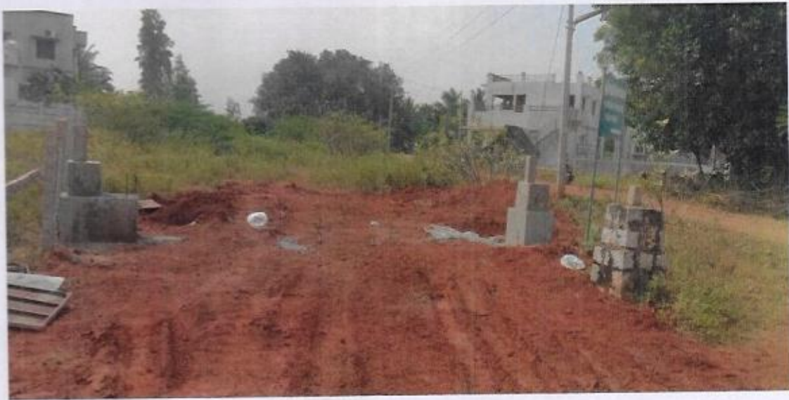
Construction of 4 feet Cement Concrete Pillar in diverted forest land