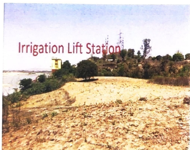
Existing Lift Irrigation Station

The location for Construction of Intake Pipeline and Water Treatment Plant for the project Patwadh Group of Villages Water Supply has been studied comprehensively and no other suitable location of intake could be found in the stretch of Sone River at the proposed location which could be construction and access wise feasible avoiding the forest land. There are no Gram panchayat or any non-forest land areas in the vicinity that could have been proposed Moreover the feasibility and technicality of this point is same as that of Lift Irrigation intake works existing in the same locality.