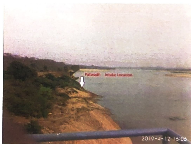
View from Irrigation Lift Station towards proposed locations (approximate) of the intake source for Patwadh Water Supply Scheme – Sone River

The Water Treatment Plant for drinking water is required to be constructed near to the intake technically. Thus the location of intake, it's pipeline and Water Treatment Plant cannot be relocated to any non-forest land.