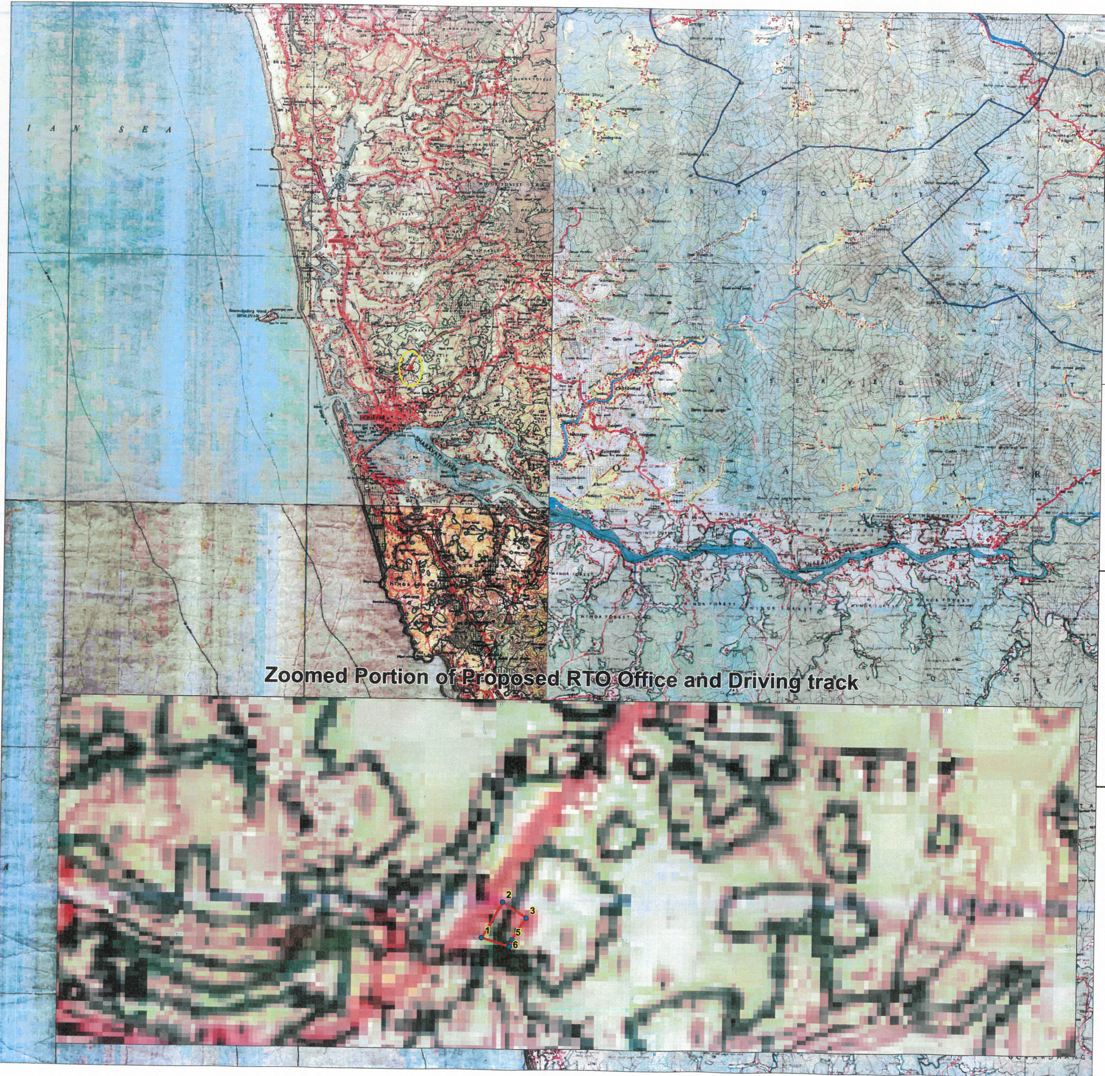
Zoomed Portion of Proposed RTO Office and Driving track