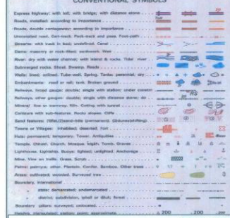
PLATE NO. 1

DETAILS OF THE AREA ADJOINING SOUTH-KALIAPANI MI