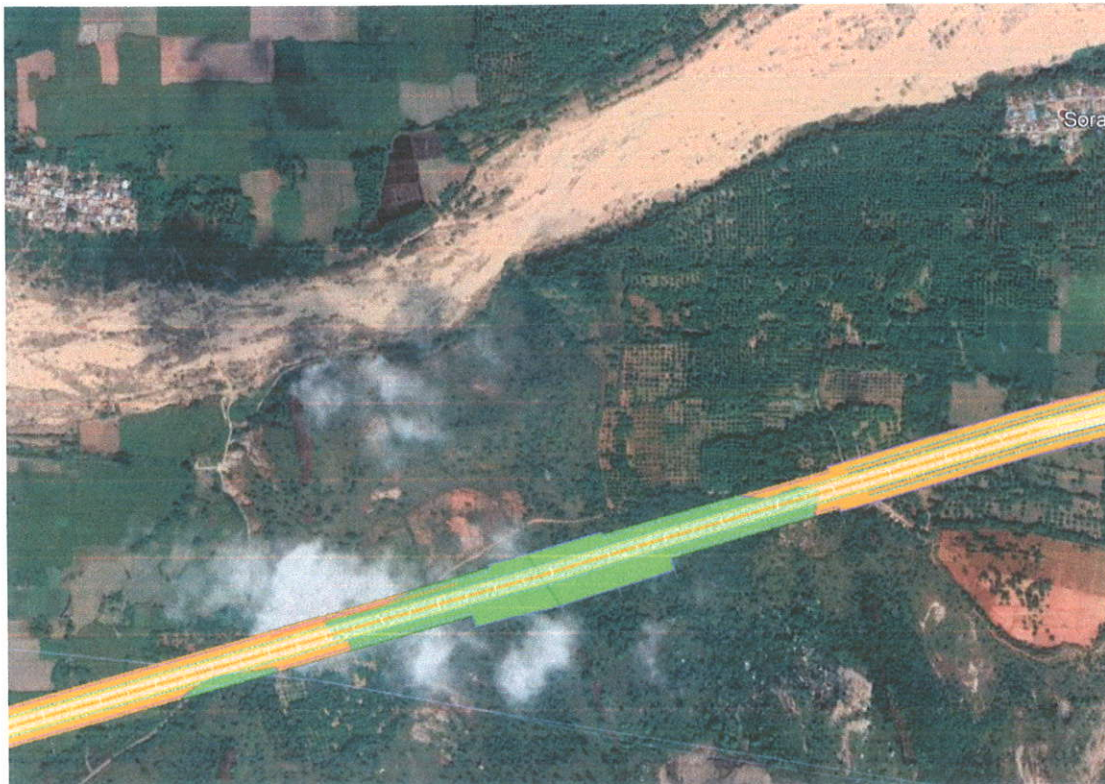
Figure 02: Forest Location in Kellpudi / Samanthawada/ Nediya Village (Ch. 50+133.20 to 50+303.95, Ch. 50+404.94 to 50+798.09, Ch. 50+798.09 to 51+276.55 & Ch. 53+102.64 to 53+383.76)