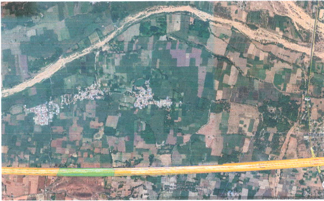
Figure 01: Forest Location in Thirumalrajupettai/ Perumanallur Village (Ch. 42245.05 to 42759.10)