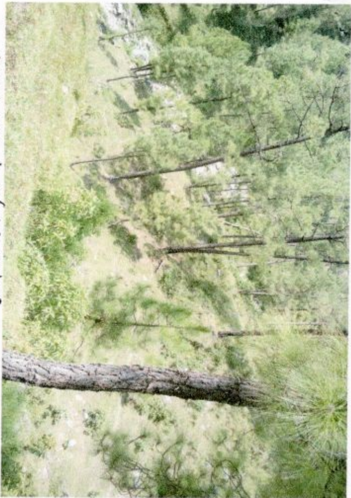
Km 1 H17-4-6 (X.S. 0/16)