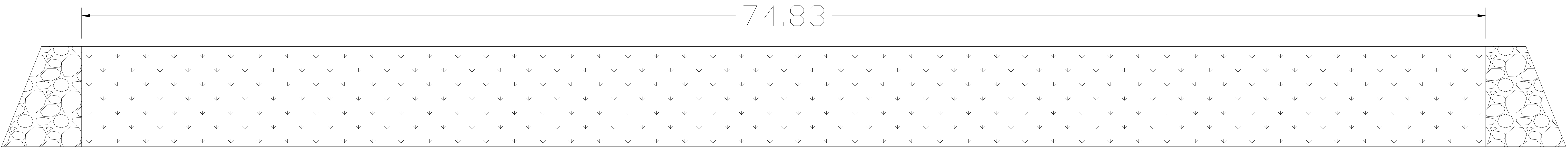
Section at Y-Y

Muck Dumping Site DS-4 Area : 425.0344 sqm Avg Hight : 13.5 m Capacity of muck /debr is to be dumped = 425.0344 \times 13.5 = 5737.964\text{cum}