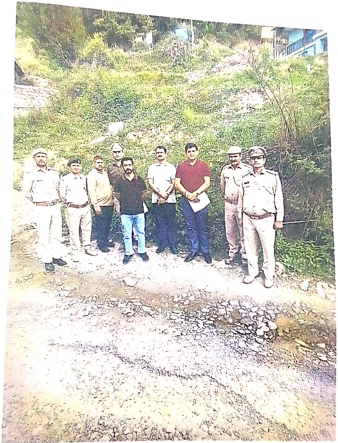
DIVISIONAL FOREST OFFICER, NAGHAN FOREST DIVISION, GOHAR, DISTT. MANDI (H.P.)