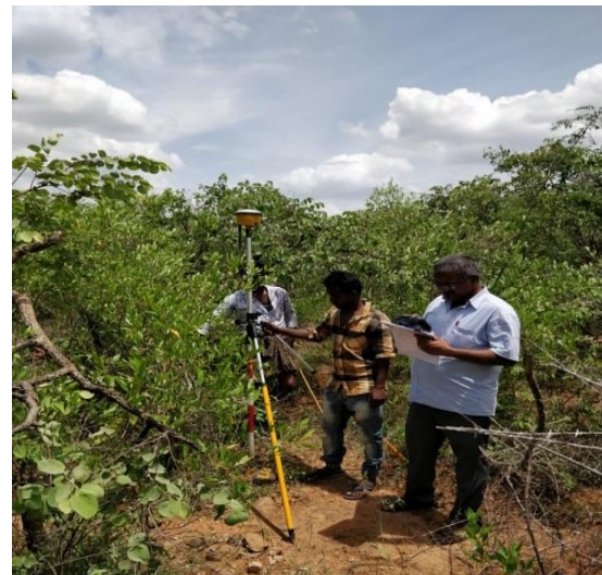
Survey along the Forest area