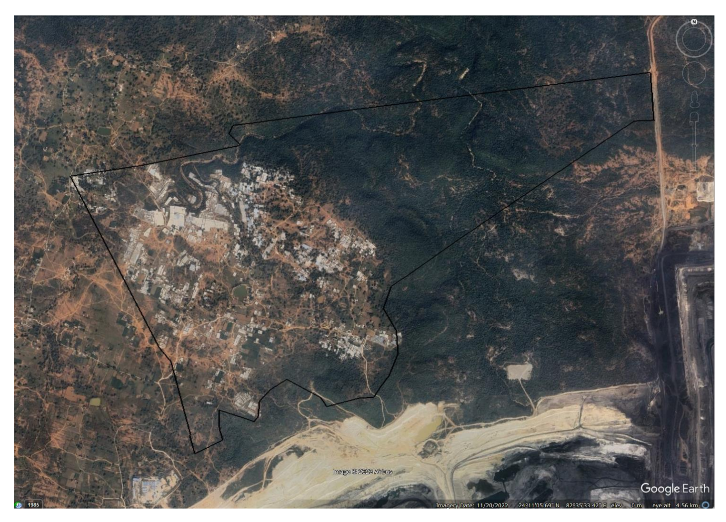
Figure 2 Snapshot of kml file of Coal Excavation Area 559.003 Ha