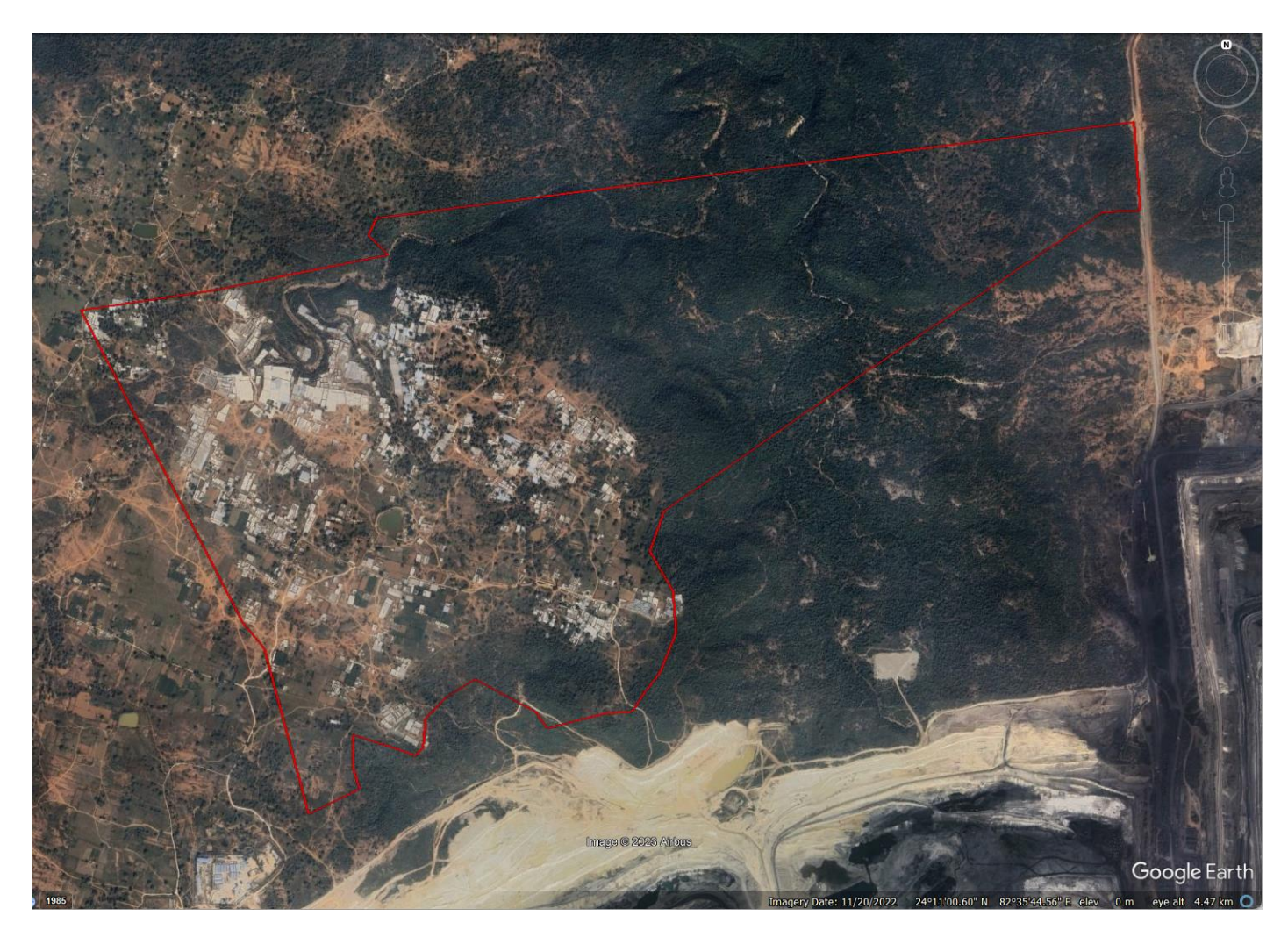
Figure 1 Snapshot of kml file of Expansion Area 564.323 Ha