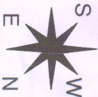
SITE AREA COMPONENTS OF PROPOSAL