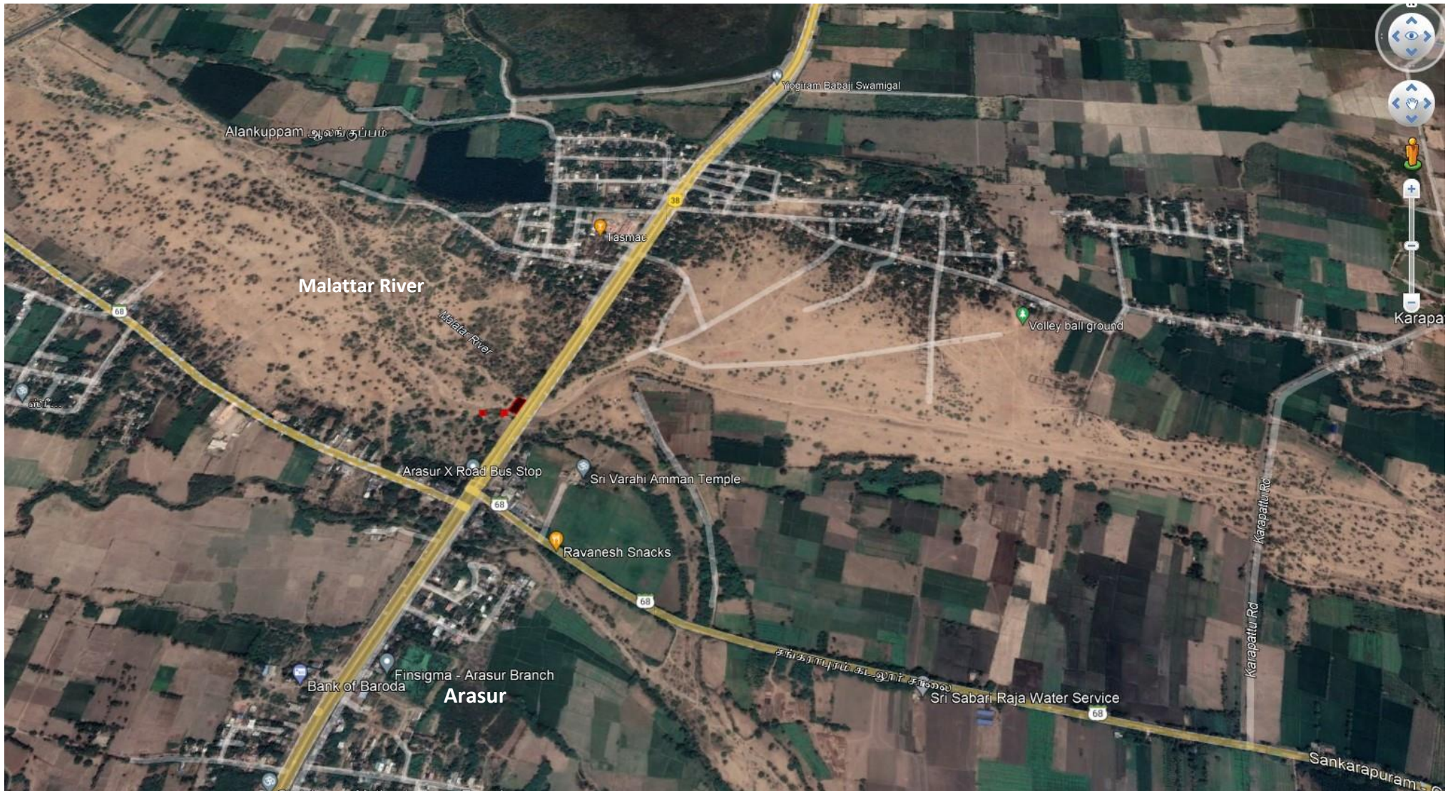
Satellite Image of proposed construction of Bed Dam LS 24600 mt, South Malattar HS LS 24400 m and Sirugrammam HS LS 24300 m works across Malattar River bed nearby Arasur village in Villupuram District (Part A)

m. 827m Executive Engineer, WRD., Lower Pennaiyar Basin Division, Villupuram - 605 602.