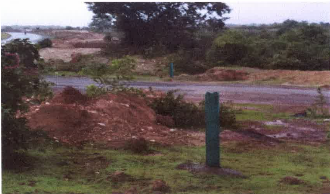
Ch. 246+200 to Ch. 246+580 (LHS)