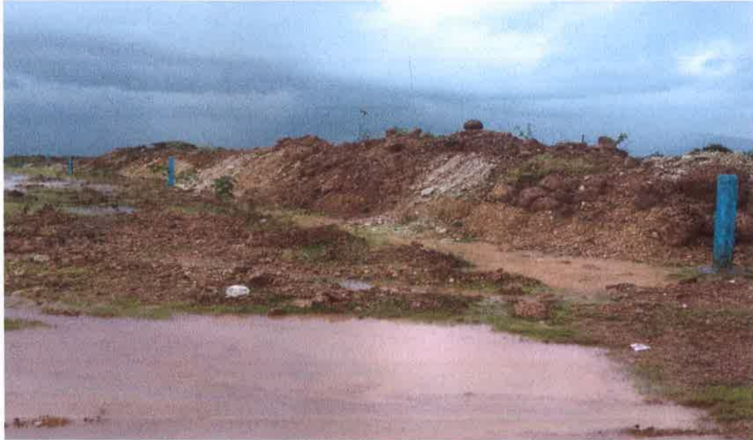
Ch. 246+200 to Ch. 246+600 (RHS)