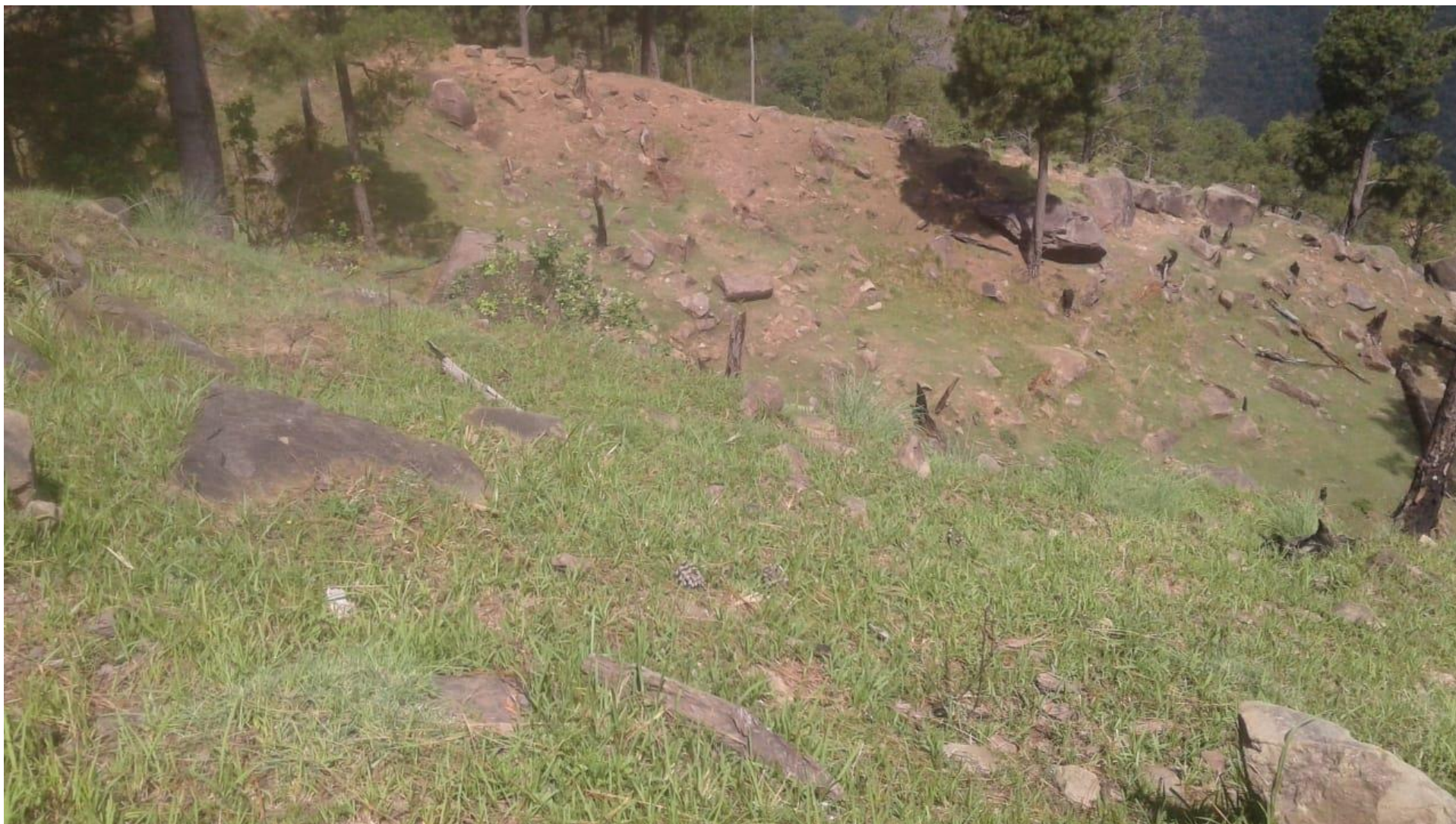
Comptt No. 87 c/D Dudu, Udhampur