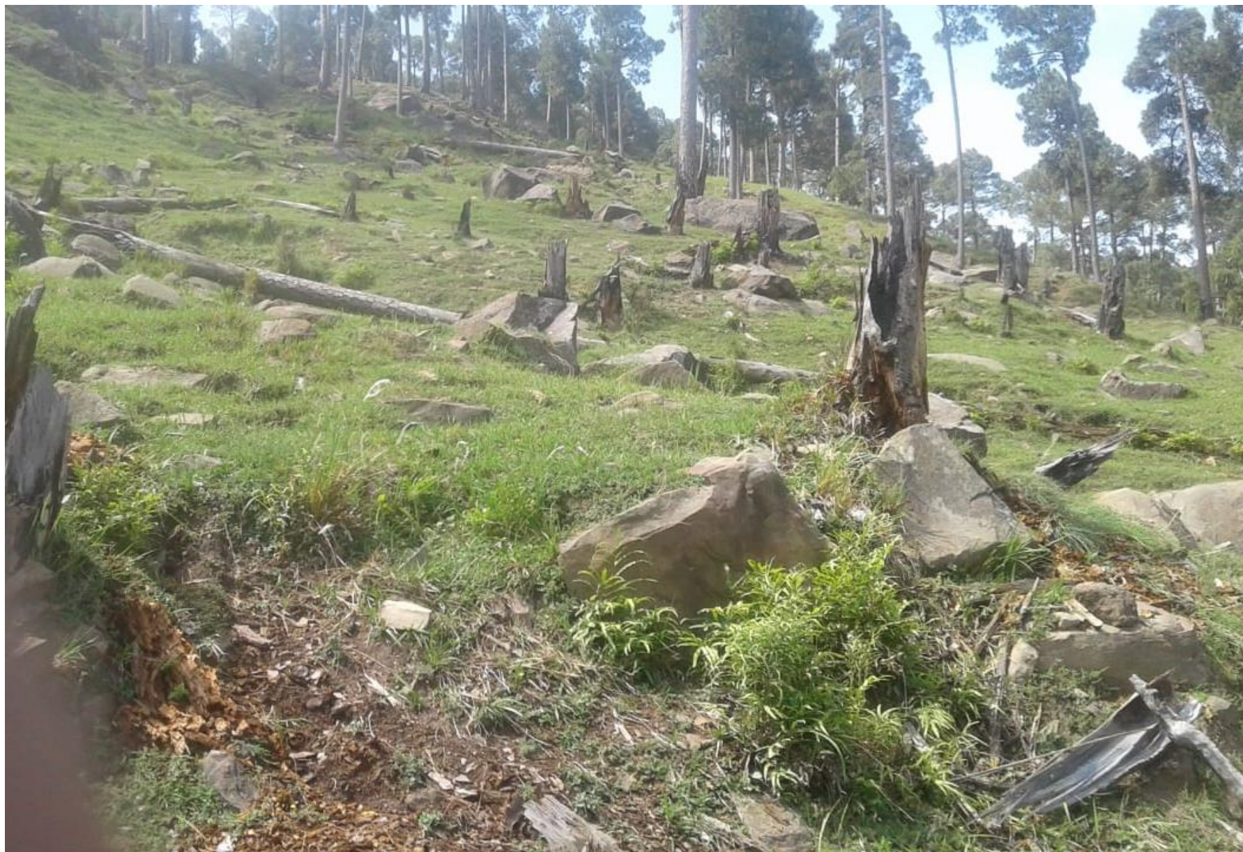
Comptt No. 87 c/D Dudu, Udhampur