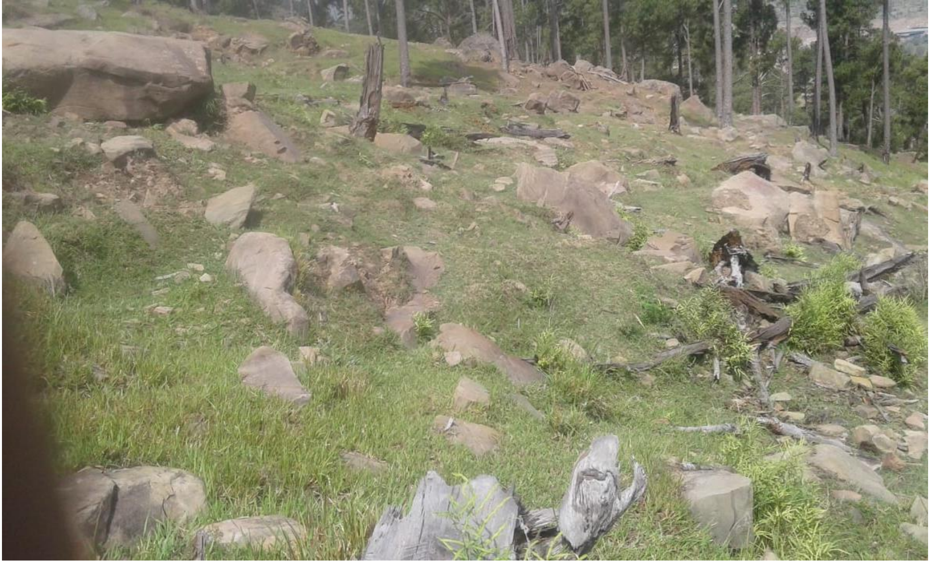
Comptt No. 87 c/D Dudu, Udhampur