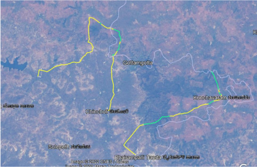
Topo Sheet Showing the Proposed OFC Route