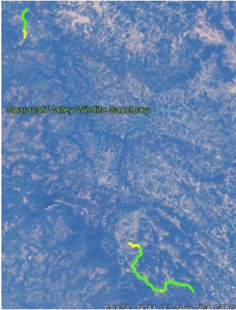
Topo Sheet Showing the Proposed OFC Route