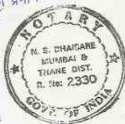
Photo Copy of the Seal

NOTED & REGISTERED Sr. No. 356 / 60745 Dated 27 MAY 2015