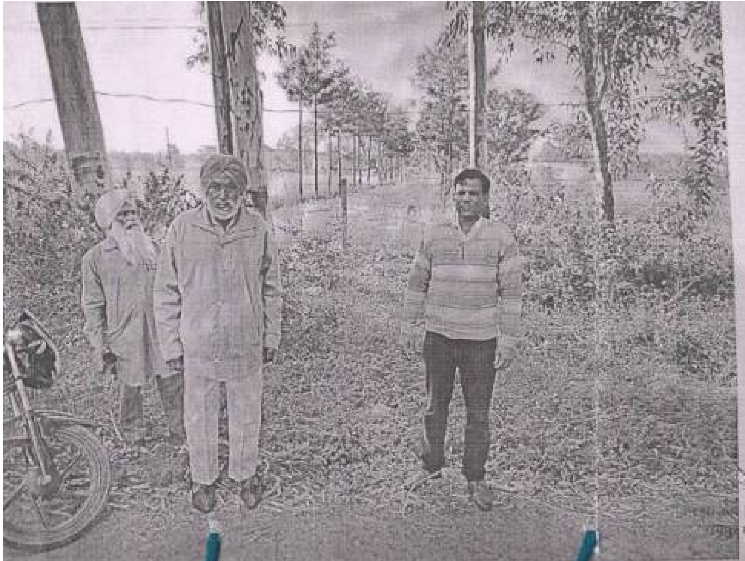
ਮਾਧੋਬ ਗੁਰੂ ਗੁਰੀ