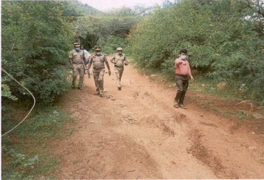
Photograph showing the inspection of proposed project site by the District Forest Officer, Dharmapuri Forest Division, Dharmapuri for formation of road from Thimmalanmedu to Kotturmalai along with the staff of Dharmapuri Range on 07-10-2021.