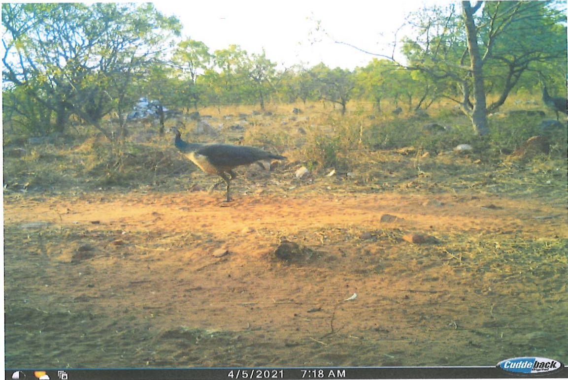
Site Inspection Photos