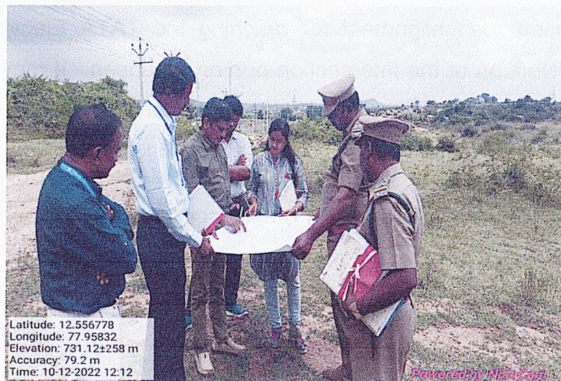
Inspection of the area proposed for diversion by the Conservator of Forests

2).The proposed area for diversion is situated outside the Cauvery North Wildlife Sanctuary and as well as its Eco Sensitive Zone area. The nearest Reserved Forest is Udedhurgam Reserved Forests which is part of Cauvery North Wildlife Sanctuary. The area contains only shrubs and no tree felling is involved due to this project.