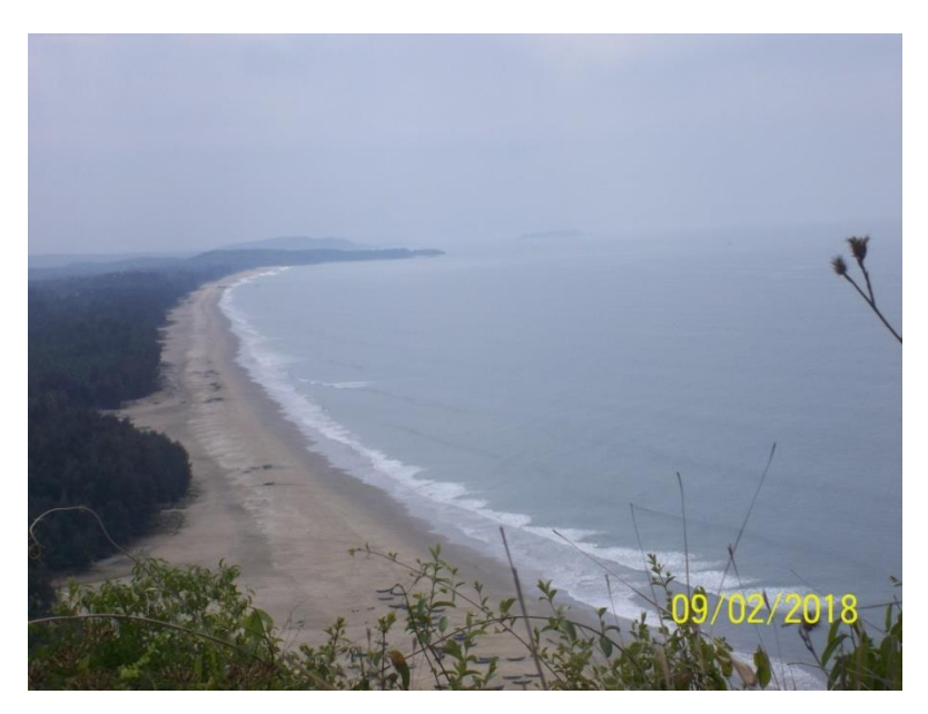
Panoramic view of Arabian sea towards south of project site.

The project site is a vacant land. The proposed project site is adjacent to the Arabian Sea and surrounded by the Arabian sea towards west, north and south side, while on the east side it is surrounded by the agricultural lands. The recent photos of the project site as shown below: