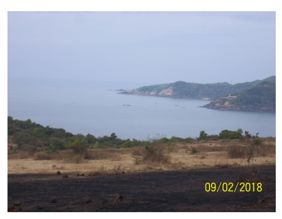
Panoramic view of Arabian sea towards west of project site.