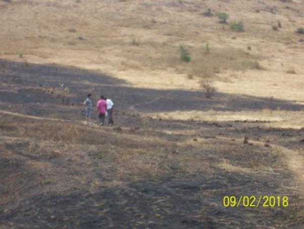
View of the proposed project site.