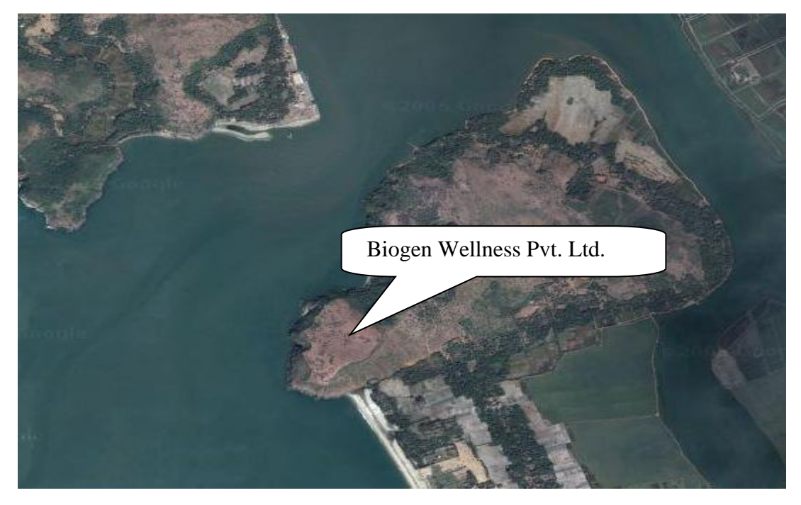
Google Map showing the Project site