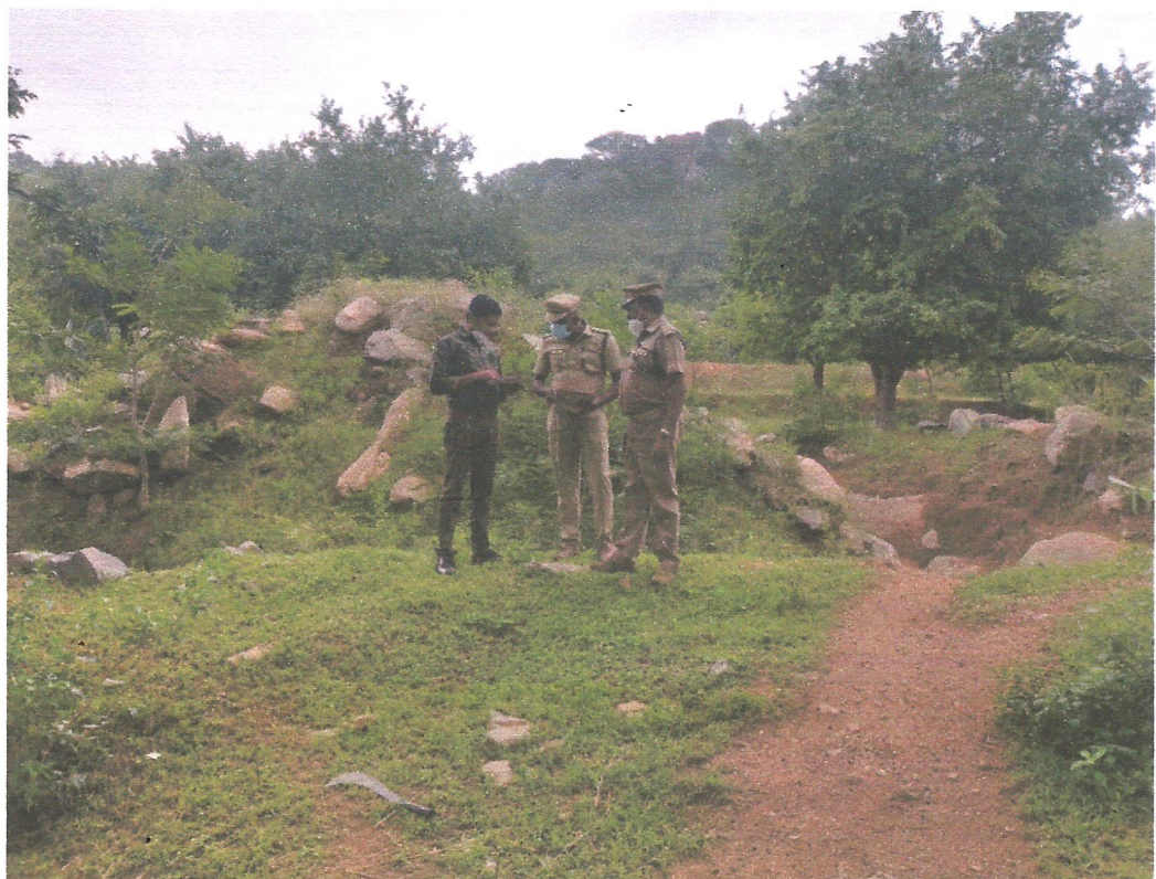
Inspection of Degraded Forest area in Gummanur Reserved Forest by the Conservator of Forests

This area has also been inspected by me on 20-12-2021 with the staff of Palacode Range.