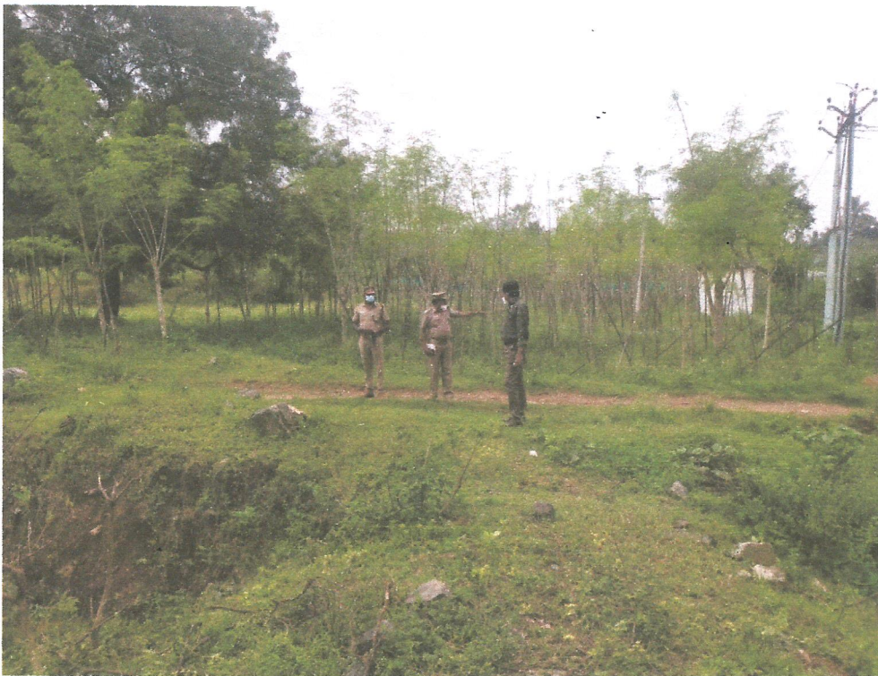
Inspection of the area proposed for diversion in Gummanur Reserved Forest by the Conservator of Forests

The Gummanur Reserved Forest is an isolated forest block which is located nearest to the village by east Giddanahalli, by west Gummanur by north Kaduchettipatti and by south Jittandahalli.