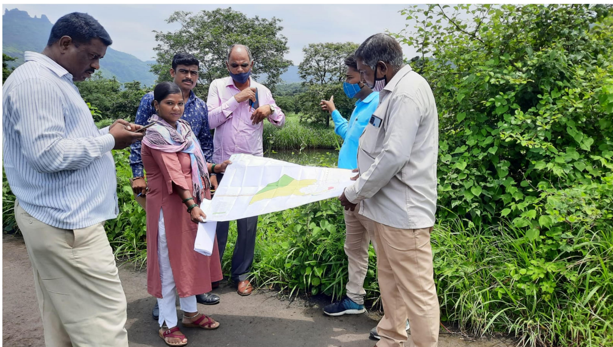
Site Inspection by Panvel Range Office on 27 August 2021