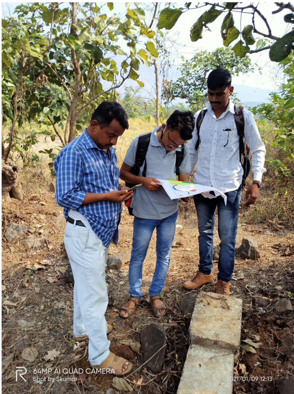
Site Inspection by Panvel Range Office during tree enumeration and site demarcation on 09-10 January 2021