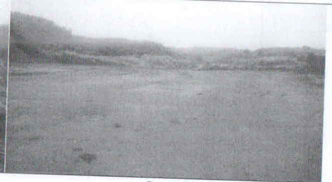
Spreading of top soil